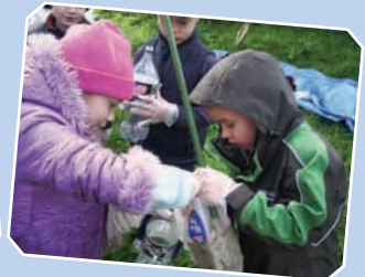
"Highly successful – both the classroom introductory session and the testing at the stream the following day. Great resources, we look forward to introducing the programme into the senior school in 2009." – Westmere School.