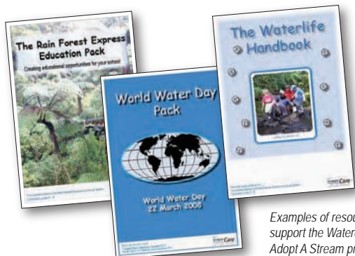
Examples of resources available to support the Watercare's Adopt A Stream programme

The programme is directed towards years five to eight but can be adapted to suit older and younger pupils. If you don't have a nearby stream you can combine an Adopt A Stream field trip with a Rain Forest Express train ride in the Waitakere Ranges. Pupils will be able to do their water testing at Nihotupu Stream.