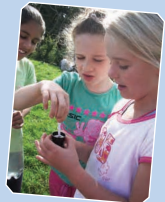
"Fantastic! Perfectly pitched for our Year 5s. They were enthralled and learned lots." – Taupaki School.