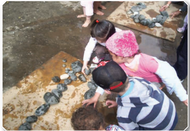
Pre-schoolers from Kids World, Avondale, make dams to store the rain water