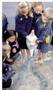
Hands-on fun with Adopt A Stream

Okiwi School, Great Barrier Island Onehunga Primary Parnell School Pigeon Mountain School Point View School Ramarama School Reremoana School Robertson Road School, Mangere Sherwood Primary, Browns Bay South Auckland Gifted Children Assoc. St Dominics School, Blockhouse Bay St Kentigern College St Therese School, Hillsborough Sunnybrae School Sylvia Park School Waikowhai Intermediate Western Heights School Westmere School